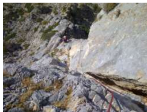
First 6a pitch

(watch out for the first 6a pitch though).